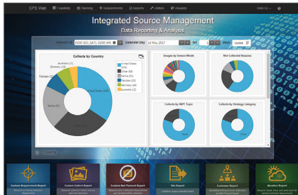
Custom Reports, Statistics, and Analytics